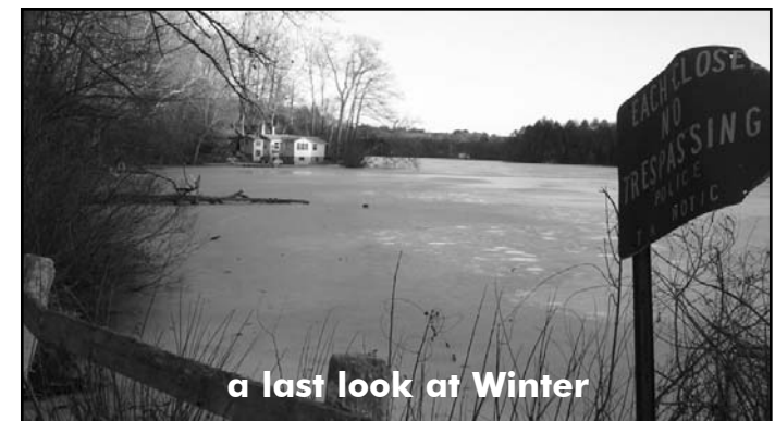
a last look at Winter