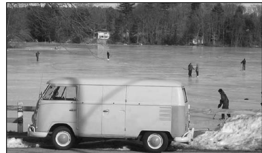
Ice Skating on the Pond.